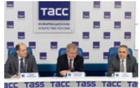
PHOTO: PRESS CONFERENCE OF THE EAPO PRESIDENT